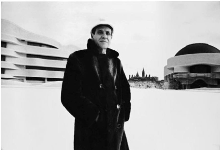
Douglas Cardinal in front of the Canadian Museum of Civilization

Cardinal designed the Museum of Canadian Civilization and did the building designs for the Oujé-Bougoumou community of the James Bay Cree. This work won the “We the People” United Nations Community Award. He also designed the Neeginan Centre recently opened in Winnipeg and was principal designer for the Smithsonian Institution’s National Museum of the American Indian. Cardinal studied architecture at the University of British Columbia and the University of Texas. He graduated with honours in 1963 and then practiced architecture in Edmonton for 18 years. He is known for his unique “organic style” of architecture. Some of his earlier commissions in Alberta include St. Mary’s Church in Red Deer, the Grand Prairie Regional College and the Edmonton Space and Sciences Centre. In 1985 he relocated his practice to Ottawa. His work has been exhibited in Europe, at New York’s Museum of Modern Art and throughout Canada.